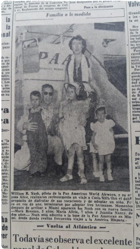
publicado el 24 de octubre de 1954 El Colombiano Medellin Colombia