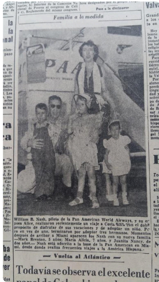
publicado el 24 de octubre de 1954 El Colombiano Medellin Colombia